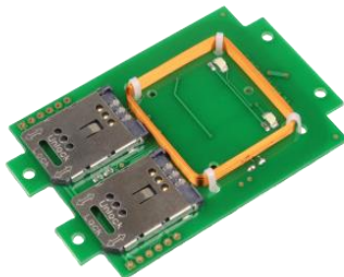
TWN4 OEM PCB Top View