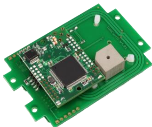
TWN4 OEM PCB Bottom View