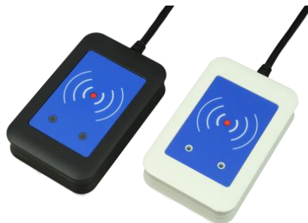
Desktop Top View

Elatec's TWN4 family of transponder readers and writers allows users to read and write to almost any 125kHz / 134.2kHz and 13.56MHz tags and/or labels – it supports all major transponders from various suppliers like ATMEL, EM, ST, NXP, TI, HID, LEGIC, etc. and ISO standards like ISO14443A (T=CL), ISO14443B (T=CL), ISO15693, ISO18092 / ECMA-340 (NFC).